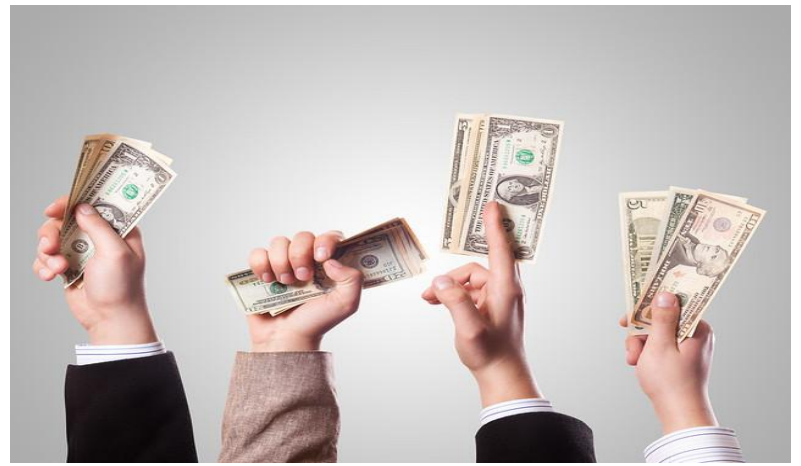
Money by Flickr user 401(K) 2012. CC BY-SA 2.0