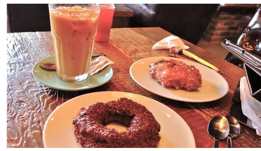
<u>Lucky's Doughnuts at 49th Parallel Roasters Café</u> | Main Street, Vancouver. Flickr user Rick Chung, RickChung.com. <u>CC BY-NC-ND 2.0</u>